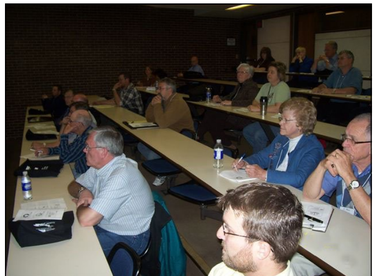
Local government officials attend one of the 28 classes held throughout the day.

Sponsored by STC, the conference is supported, in part, through a grant from the Appalachian Regional Commission (ARC)