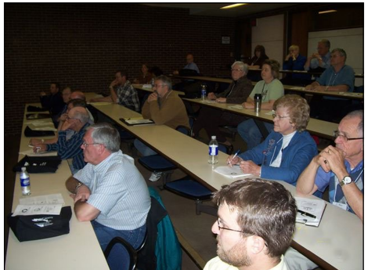
Local government officials attend one of the 28 classes held throughout the day.

Sponsored by STC, the conference is supported, in part, through a grant from the Appalachian Regional Commission (ARC)